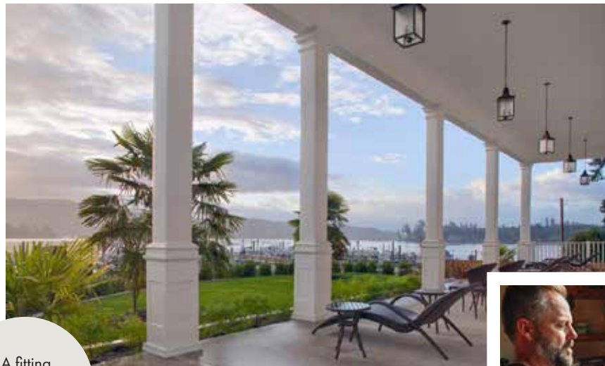
A fitting rainbow over Prestige Hotel.

Amazing views from the patio of Stickleback West Coast Eatery.