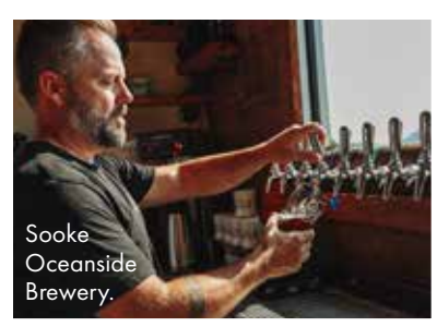
Sooke Oceanside Brewery.