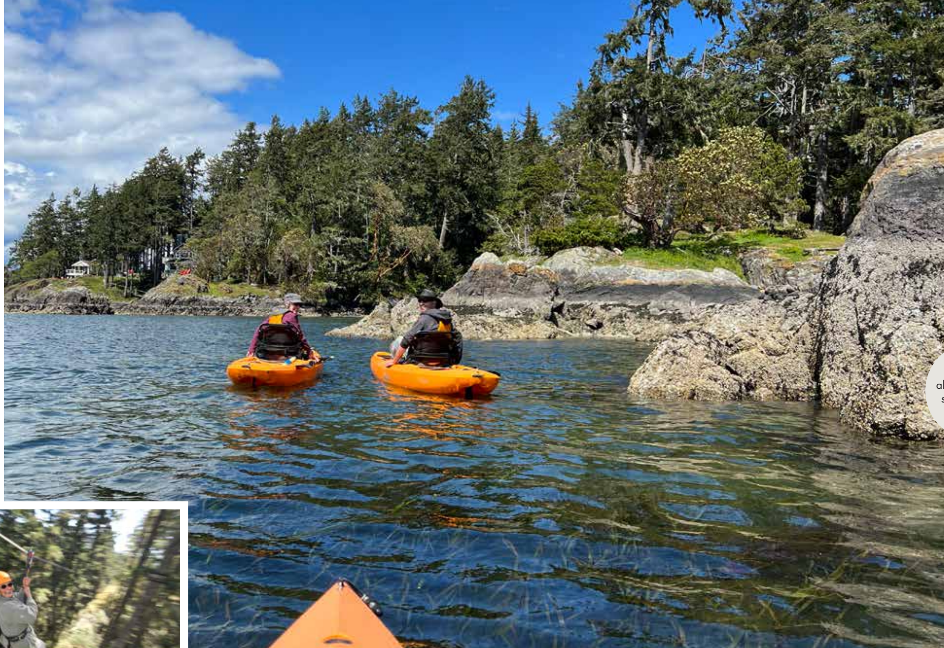
Paddling along the ocean shoreline near Sooke.