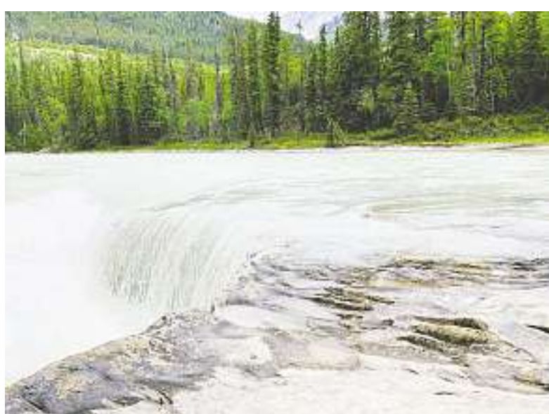
Waterfalls, wildlife and outdoor adventures abound.

This writer was a guest with Tourism Golden, which neither read nor approved the article before publication. For more information and hiking maps, visit tourismgolden.com and HelloBC.com .