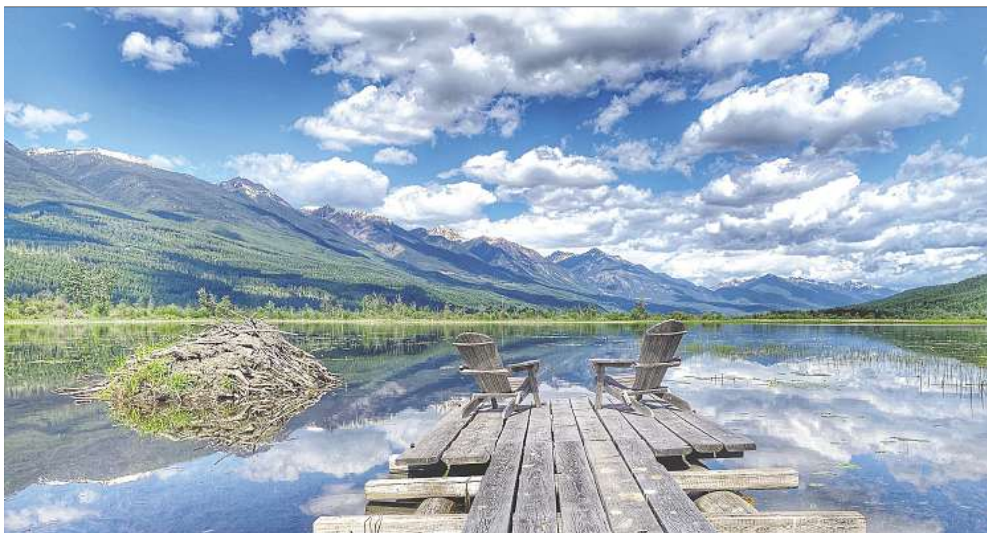
Kick back and spend a gorgeous afternoon with just a few beavers at Columbia Wetlands near Golden, with a backdrop of magnificent mountain views. JANE MUNDY

The tasting room only seats 44 so arrive early. The duck shepherd's pie is one of Eleven22 restaurant's calling cards — a local favourite and now mine.