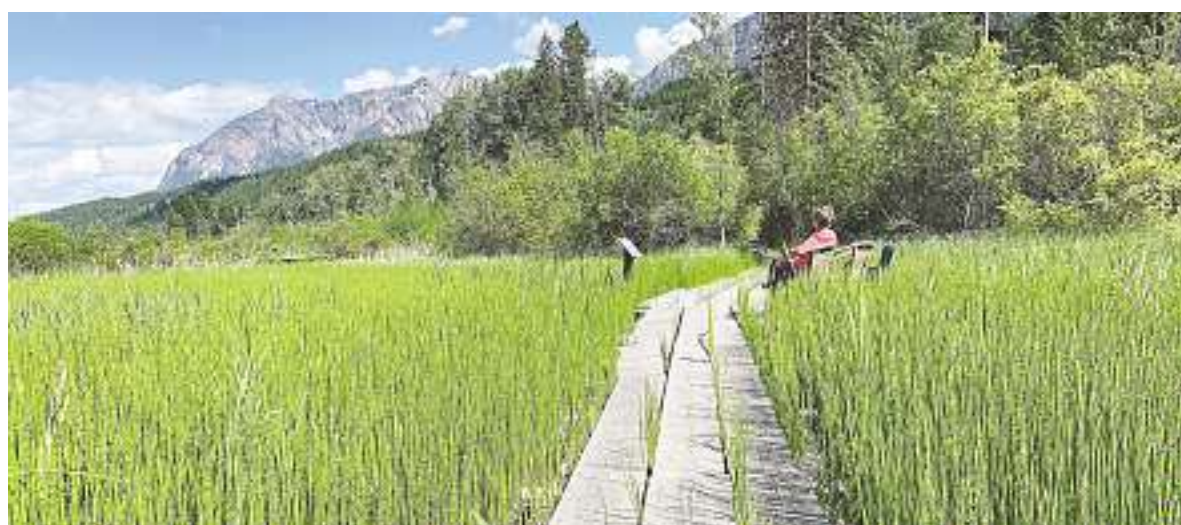
A boardwalk runs through the Columbia Wetlands, one of the most undisturbed river sections in North America.

Nichol guaranteed we would see a bear and true to his word, we did catch the tail end of a grizzly running down the logging road.