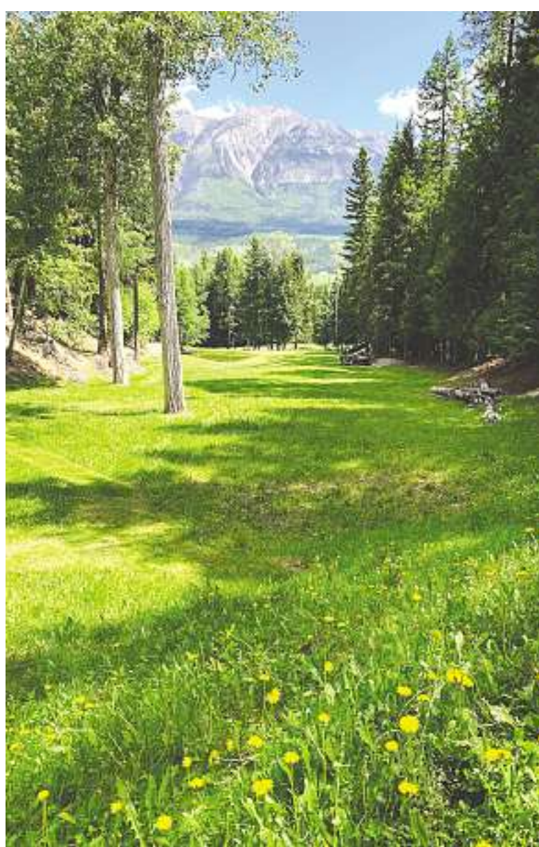
Organic Sports Ranch features a 55-hole disc golf course.