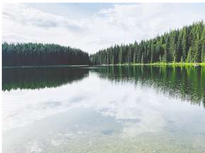
Pristine lakes surround Golden, which offers access to six national parks.