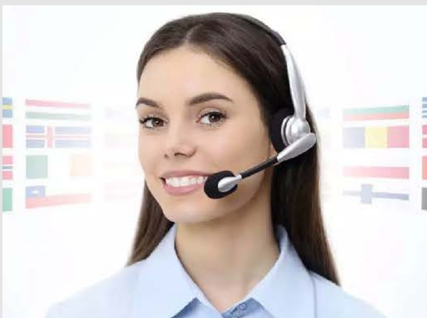
A good travel agent can help ensure your travel is hassle free.

If you enjoy spending hours online planning a vacation and taking in stride glitches that can arise, read no further. If your trip simply involves a few return tickets to visit family and one sleepover at an airport hotel, you can likely book it yourself.